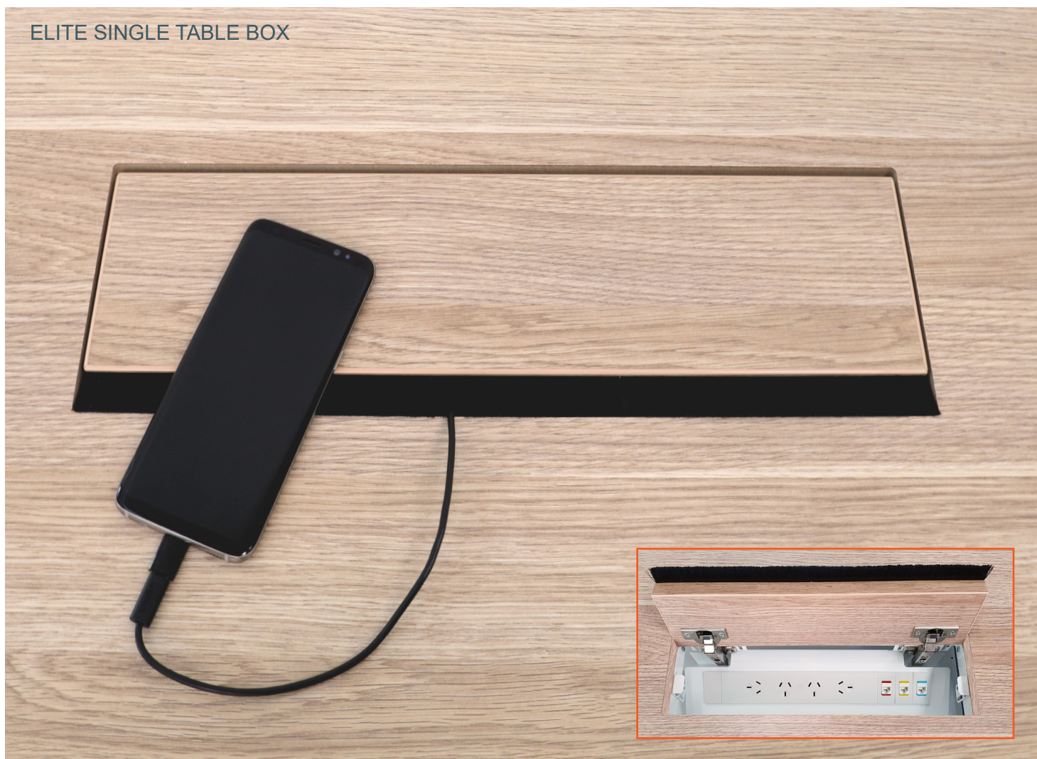
ELITE SINGLE TABLE BOX